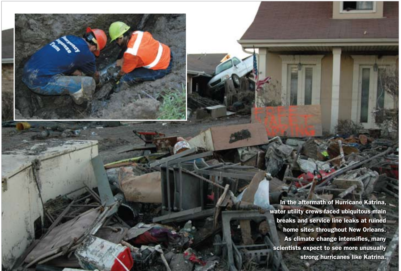
In the aftermath of Hurricane Katrina, water utility crews faced ubiquitous main breaks and service line leaks at ruined home sites throughout New Orleans. As climate change intensifies, many scientists expect to see more unusually strong hurricanes like Katrina.

Water utility managers have an obligation to consider potential effects of climate change and to assess mitigations for them as a part of ongoing planning efforts.